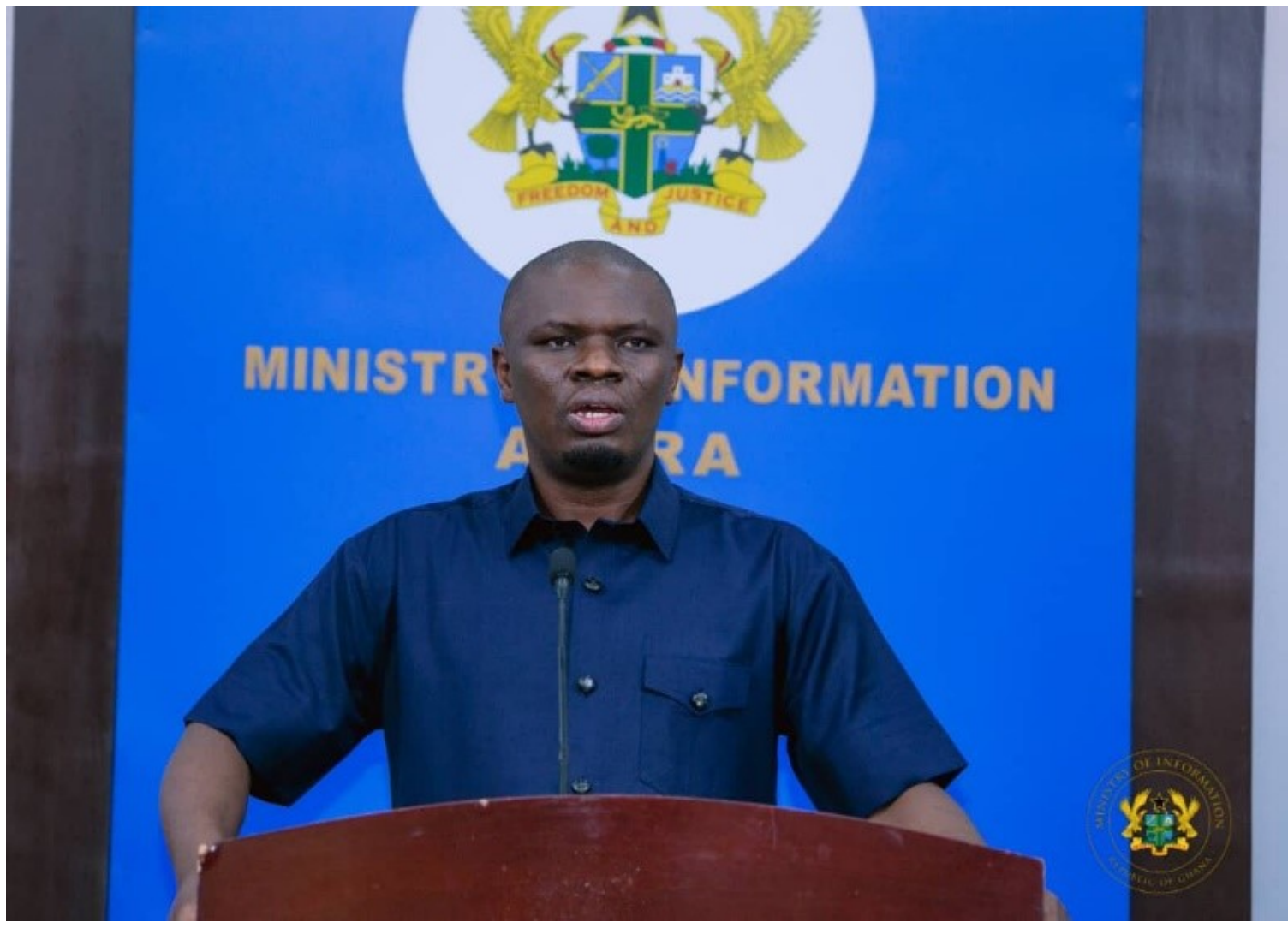
Hon. Mustapha Ussif, Minister for Youth and Sports,

The Minister for Youth and Sports, Honourable Mustapha Ussif has maintained that the country stands ready to host the African Games.