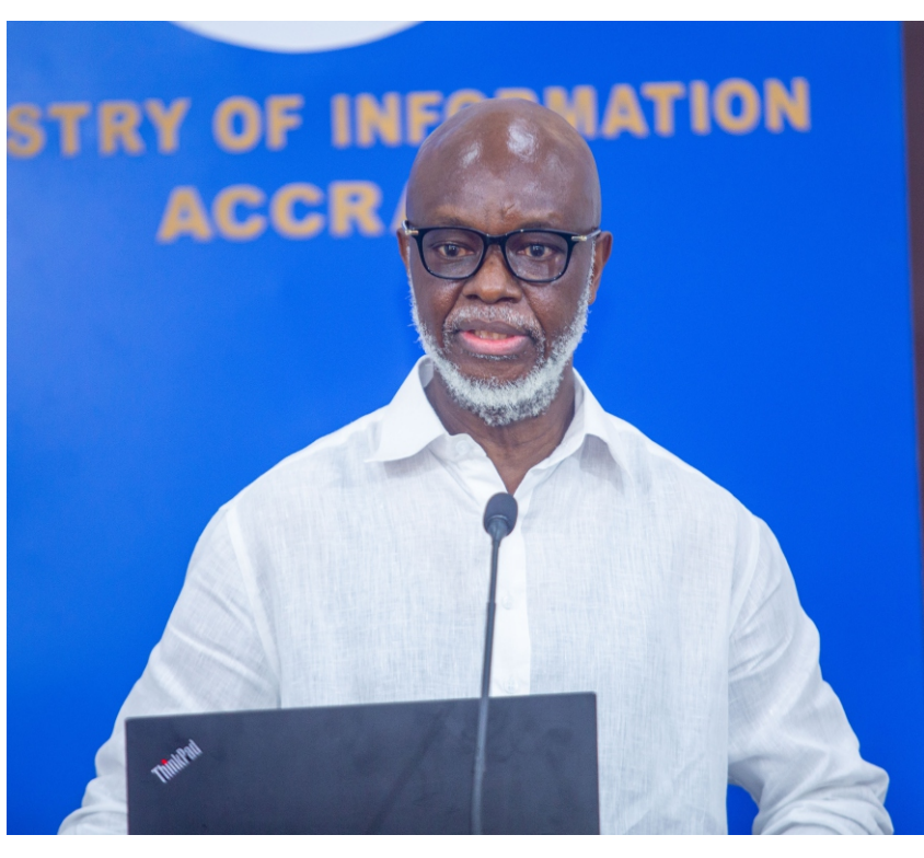
Director General, National Communications Authority,

"We are happy to note also that the NCA in 2023, licensed a fifth cable landing operator, Bayobab, operator of the 2Africa Cable with a design capacity of 180tbps which is about four times the combined design capacity of the existing cables; this service is expected to be operational by 4th Quarter of 2024 or sooner", he said