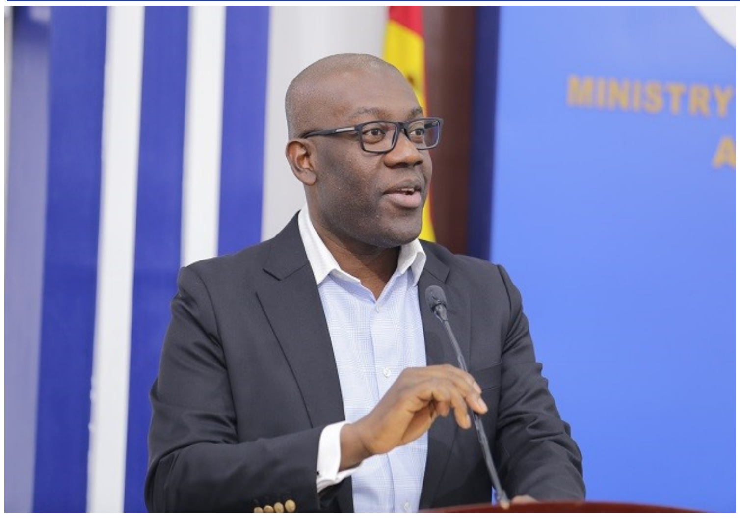
Former Minister for Information, Hon. Kojo Oppong Nkrumah

The former Minister for Information, Honourable Kojo Oppong Nkrumah, has urged staff of the Ministry to continue to safeguard and enhance the media support initiatives initiated during his tenure as Minister.