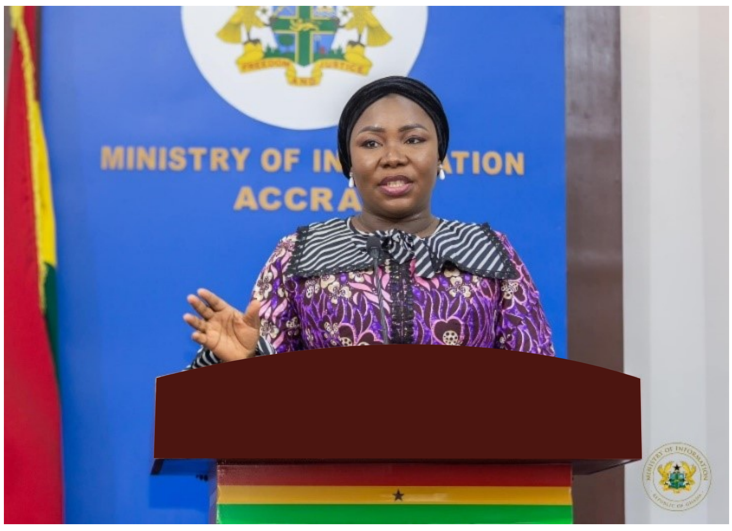
Minister for Information Designate, Fatima Abubakar

The Minister for Information Designate, Fatimatu Abubakar has said that she would continue to work on some of the innovative media support programs that her predecessor, Hon. Kojo Oppong Nkrumah initiated at the Ministry.