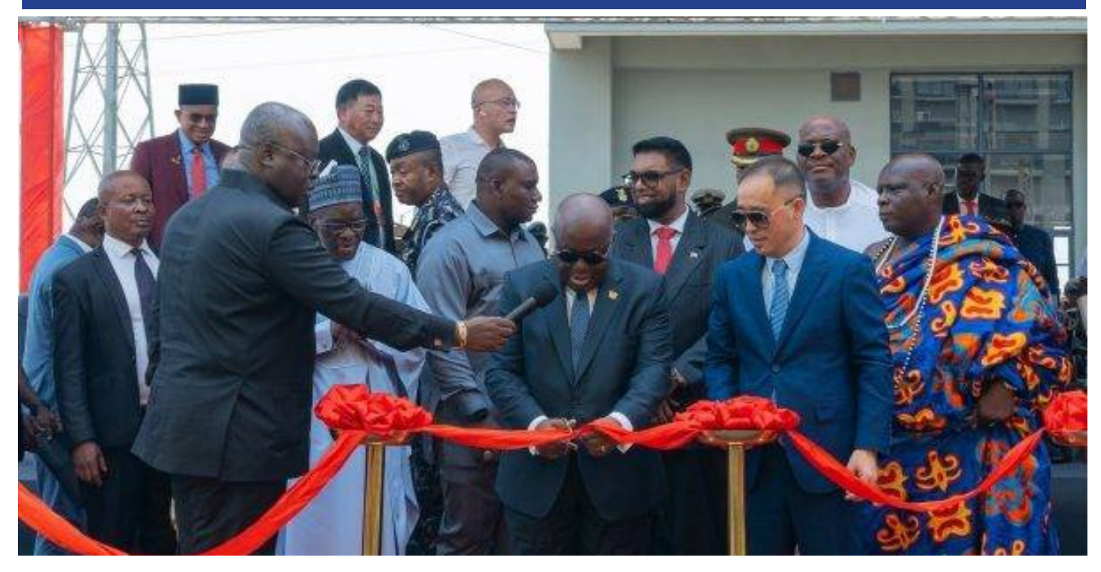
President Akufo Addo cutting sword for the inauguration of the private oil refinery

President Nana Addo Dankwa Akufo-Addo has Inaugurated Ghana's first private oil refinery and pledged to revitalize the state-owned Tema Oil Refinery (TOR). Constructed by the Sentuo Group Ghana, a Chinese conglomerate at the Tema Industrial Area, the first phase of the new refinery is anticipated to process an initial capacity of 40,000 barrels per day and then scale up to 100,000 barrels per day by the end of the year. The second phase of the facility is anticipated to be finished this year, and would raise its capacity to five million barrels per year.