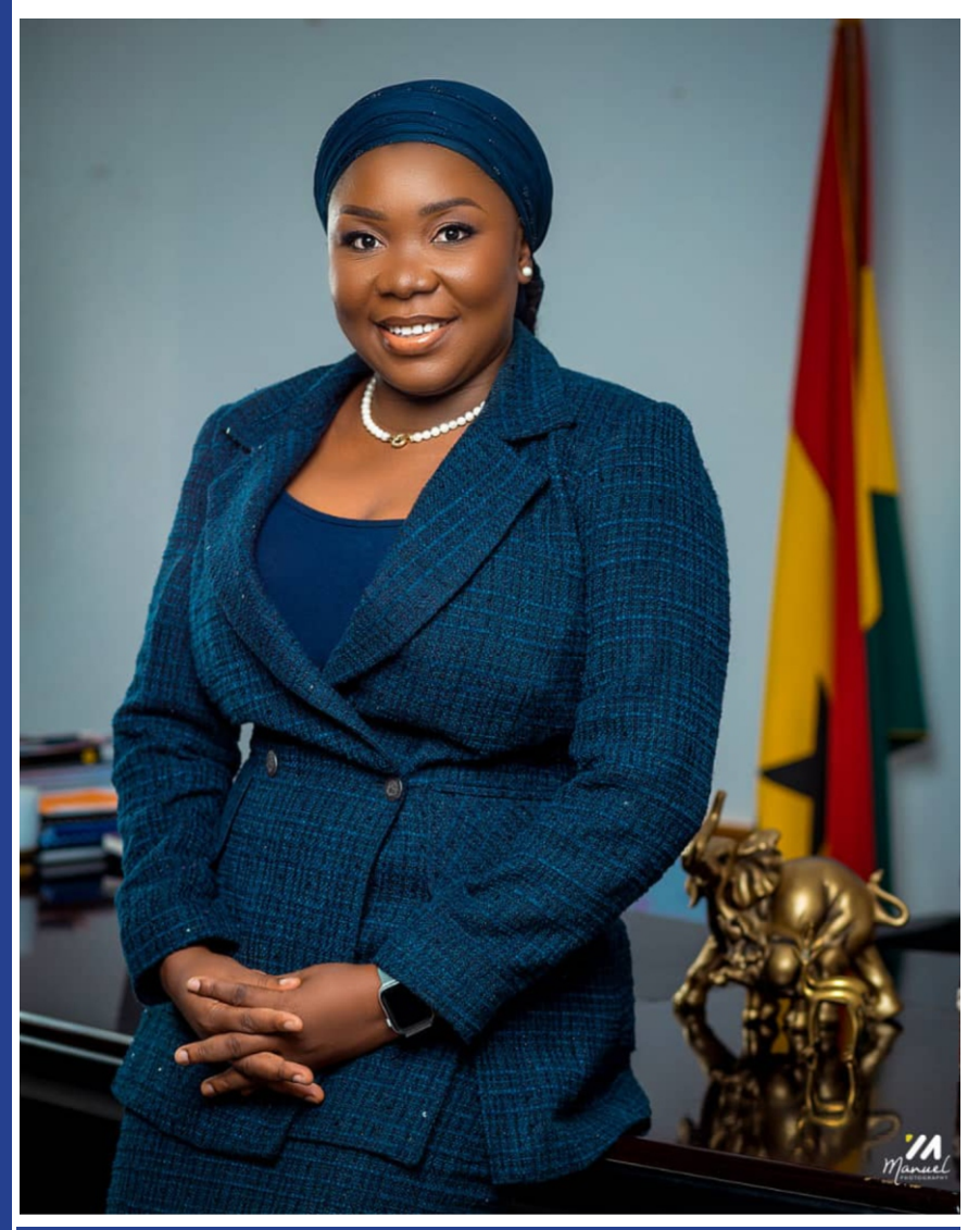
Hon. Fatimatu Abubakar Minister for Information Designate

In February 2024, she was appointed as the Minister Designate for Information.