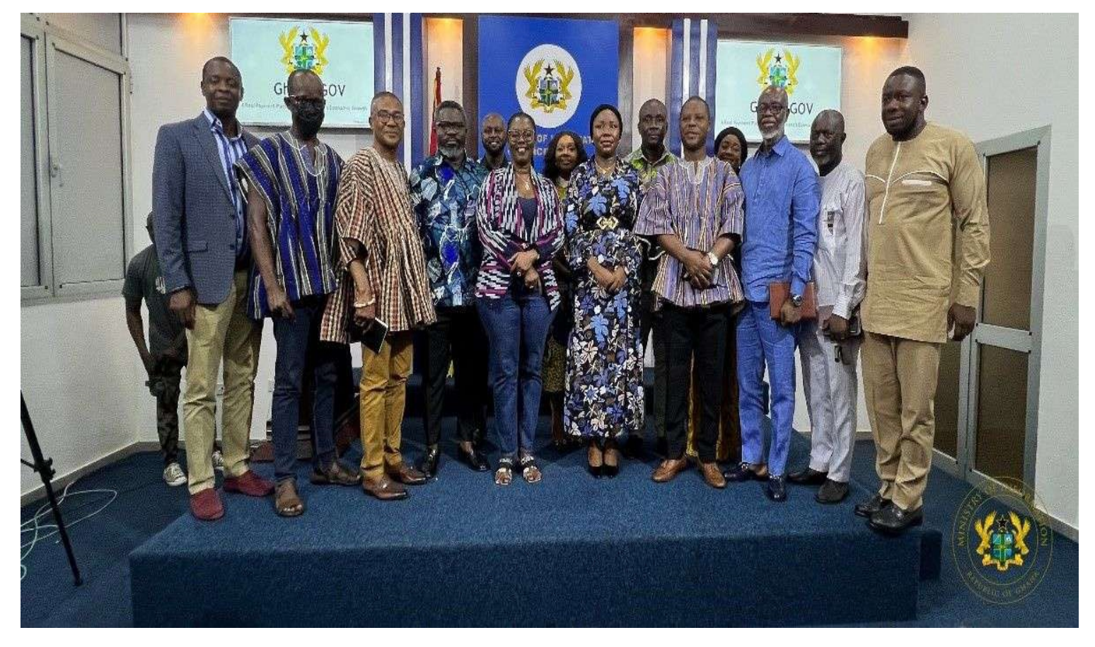
Minister for Communications, Info Min. Designate(midle) and dignitaries

Ghana has taken a significant step towards fostering regional integration as it announces the rollout of the ECOWAS Free Roaming Initiative, a move aimed at facilitating seamless communication across West African nations.