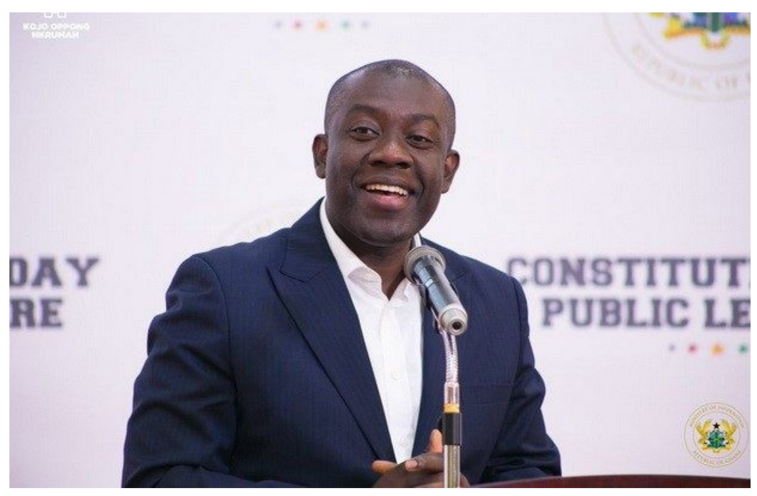
Former Minister for Information, Hon. Kojo Oppong Nkrumah

The Minister for Information, Honourable Kojo Oppong Nkrumah has affirmed Government's commitment to ensure that the broadcasting bill is laid before parliament.